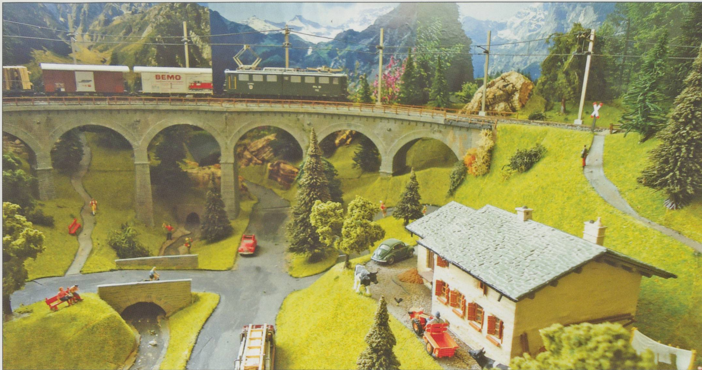
Ge6/6II No.702 'Curia' on the viaduct outside Valcava. Fishermen pay no attention but a photographer is in place to record the train.