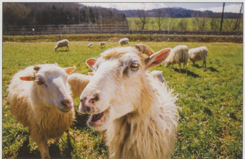
"We are the sheep!"

SBB has some 2,700ha of embankments and cuttings, an area equal to 3,800 football pitches. Keeping these trimmed and stable is a big and costly task. In the interest of sustainable resource use, and efficient operations, SBB have arranged with Pro Specie Rara, an association which helps preserve rare, historic and threatened species, that flocks of sheep will in future be used, under expert supervision, at various locations. The breed of sheep to be used is unusual. They are 'Skuddn' sheep, originally from Estonia, Lithuania and the former German East Prussia, and are believed to be an early Celtic breed, and accustomed to hard conditions, but by 1970 they had almost died out. Subsequently they have been bred in Germany and Switzerland and are now well established again. SBB expects that a single small flock can clear 1000 m 2 (1ha) in a 22-hour working day – apparently the sheep only sleep for 2 hours a day! Additional advantages are that by being selective feeders