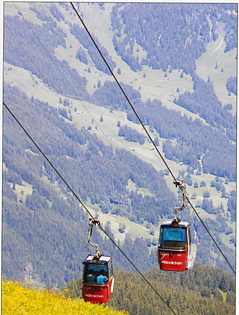
TOP: The new passing loop between Wengen and Allmend.