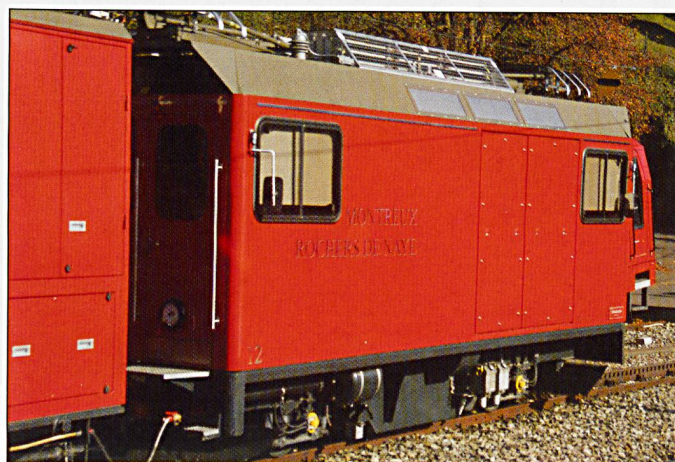
TOP: Bhe 2/4 No. 204, from 1938, at Caux.