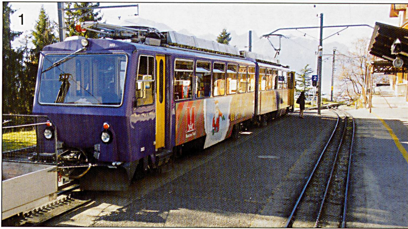
June 2015 Swiss Express .

So we arrive in Glion. A few paces bring us to the platforms and workshops, of the next railway, the Glion-Naye. This was a conventional SLM standard mountain railway with Abt rack, steam locomotives and 800mm gauge. The objective was the Rochers-de-Naye, a spectacular panorama point above Lac Léman, with alpine views in all directions. The first section, Glion to Caux, was opened on 2nd July 1892, and the station building and restaurant are unusually elaborate. They are in fact integrated even today into the grounds of the 'Caux Palace Hotel'. On 28th July 1892 a further section was opened, and