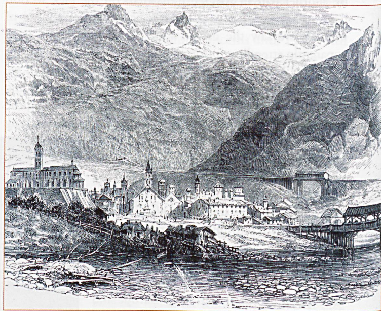
Main Picture: The Rigi Railway.

Among the drawings are the few illustrated here that have a railway connection. The picture of Brig (or Brieg) is before the coming of the railway, but the church that overlooks the Stockalper Palace is seen on the left and the pass road climbing the Simplon is in the background. The Devil's