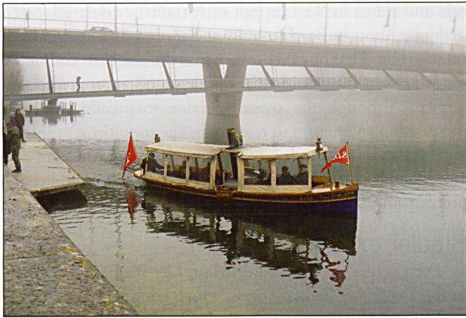
'd/s St Urs' on a misty Aare.