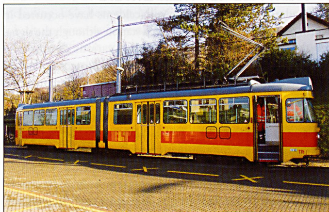
Old BLT Tram out of service at Rodersdorf.