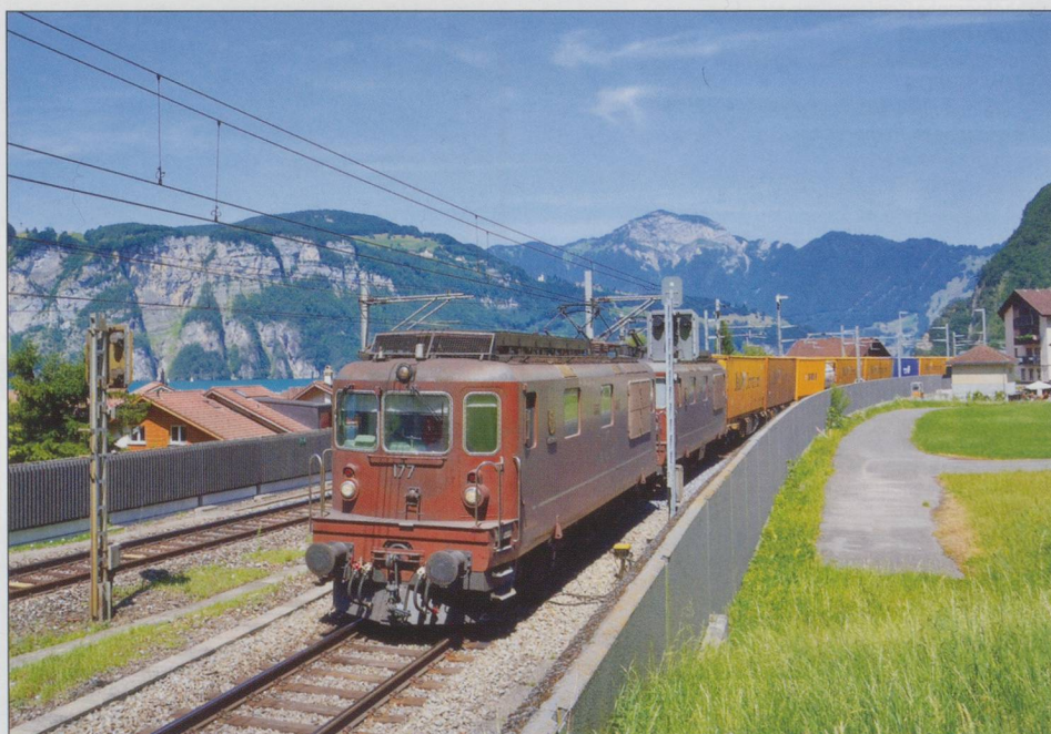
BLS Re 4/4 No.177 +1 at Sisikon 11 July 2015.

The amount of traffic traversing the line was phenomenal. While at Amsteg-Silenen one afternoon there were about sixteen trains in some eighty minutes (about one every five or six minutes), and quite often at Göschenen there were five or six trains in quick procession. Freight trains, nearly always double, triple, and sometimes quadruple, headed (and sometimes with a banker a well), were operated by various operators, including SBB, BLS, DB and Crossrail. Re4/4s and Class 460s hauled passenger trains on the IR Basel/Zurich Locarno services, RABDe500s on the IC Zürich-Chiasso service, and ETR470s and ETR610s (RABe503s) on the EC Zürich-Milan services. The ETR470s were an added bonus, as they should have been withdrawn by the time I was there. Three were in regular service all in FS livery and I even managed a final ride on one from Lugano to