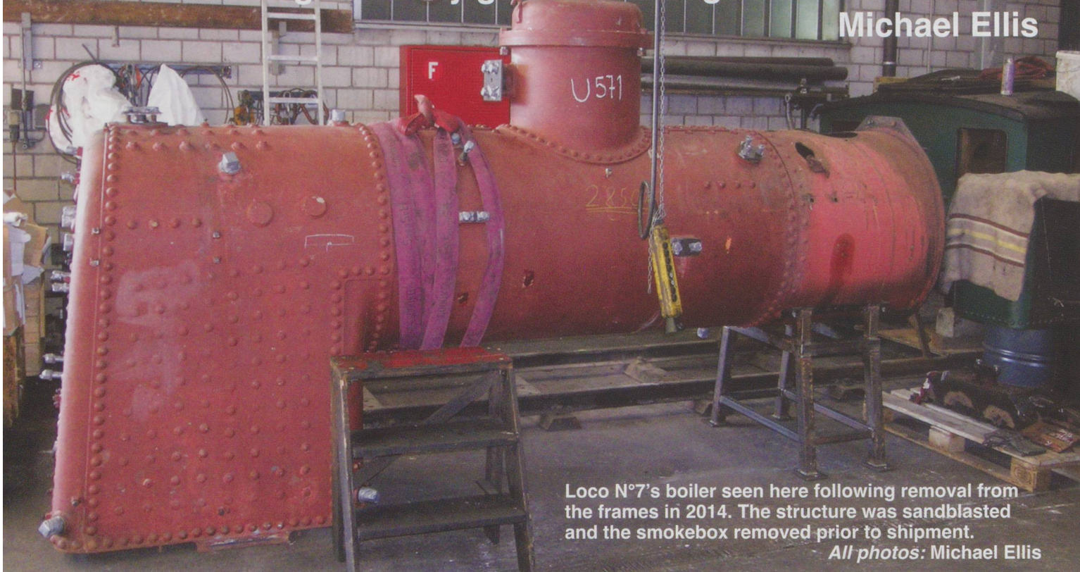
Loco N°7's boiler seen here following removal from the frames in 2014. The structure was sandblasted and the smokebox removed prior to shipment.