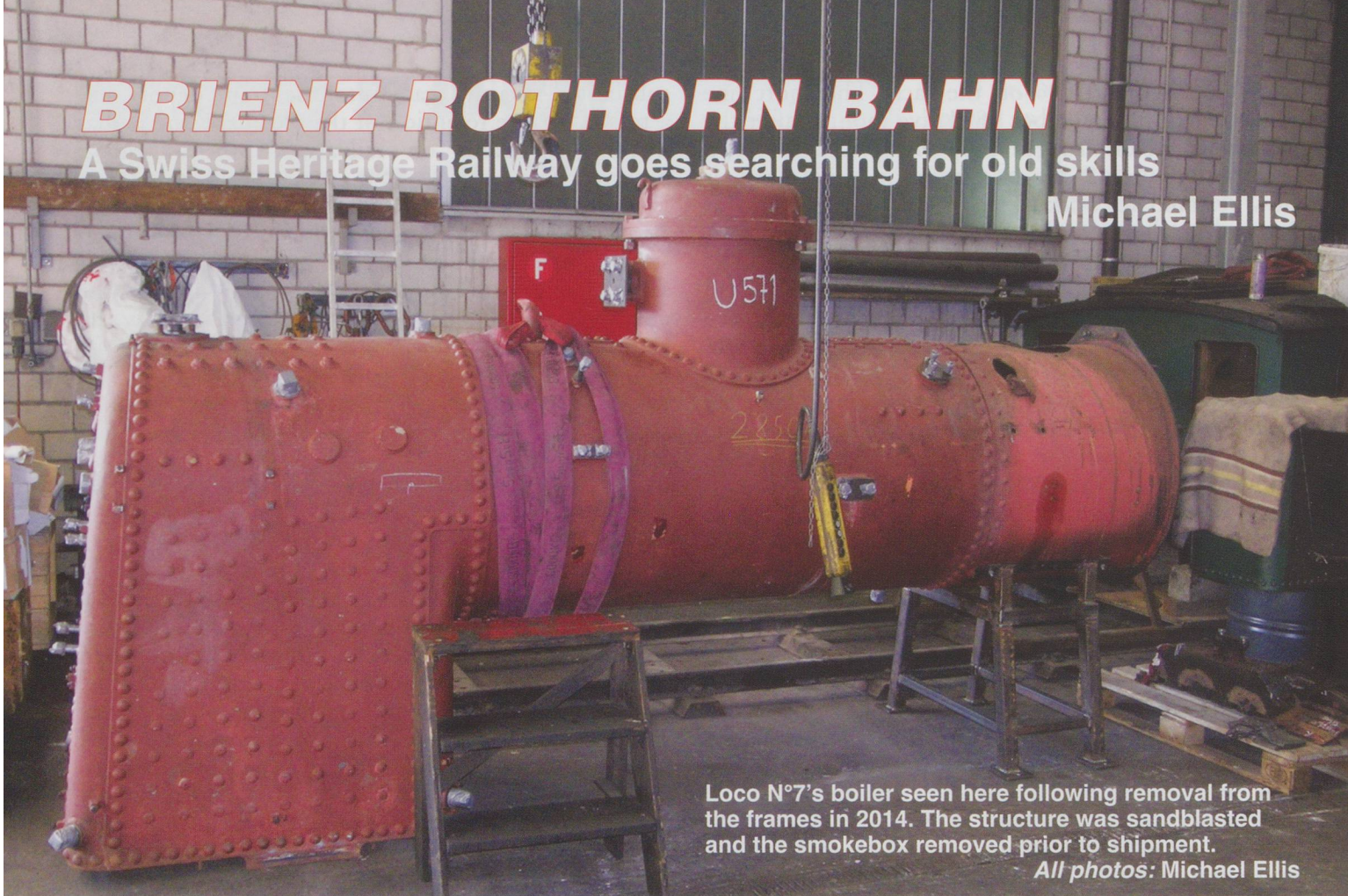
Loco N°7's boiler seen here following removal from the frames in 2014. The structure was sandblasted and the smokebox removed prior to shipment.