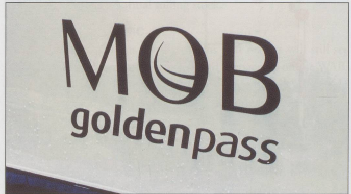
The new MOB Logo.

of the through service from Montreux to Interlaken, using coaches specially equipped with the variable-gauge bogies developed by the MOB. Also on 21st November the MOB opened the rebuilt Château d'Oex station. A description of this is in an article on Page 10.