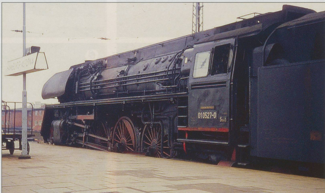
DB 01 No.0527 at Hamburg Altona.

Holidays with the family were in Berner Oberland or Graubünden. I find a note that on the Brienzer Rothorn Bahn on a good day, locomotives Nos.1,2,3,4,5 and 7 all left in convoy on a late morning departure; previously No. 6 had taken the 10.19. There were no reserves; all were up the mountain. Today Nos.3 and 4 have been stored for many years out of use, but who thought we would have four new engines built in 1996? Although SBB steam finished in 1968, there were still a number of industrial and private (often ex-SBB) locomotives in regular use. Emmenbrücke, Chippis, Choindez, Reuchenette, Winterthur, Domat-Ems and others could all reward a searching look. The Blonay-Chamby Museum Railway opened in 1968, and we soon found it. Most Swiss main lines