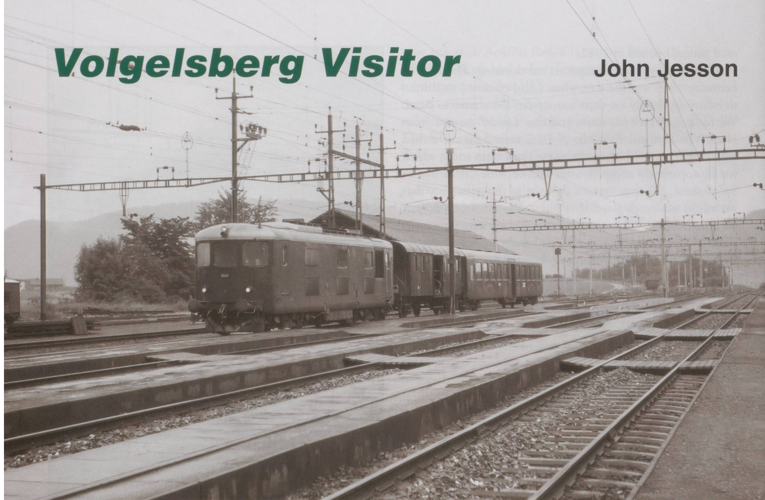
SBB Bm4/4 II No.18451 on a passenger train from Singen at Etwilen.