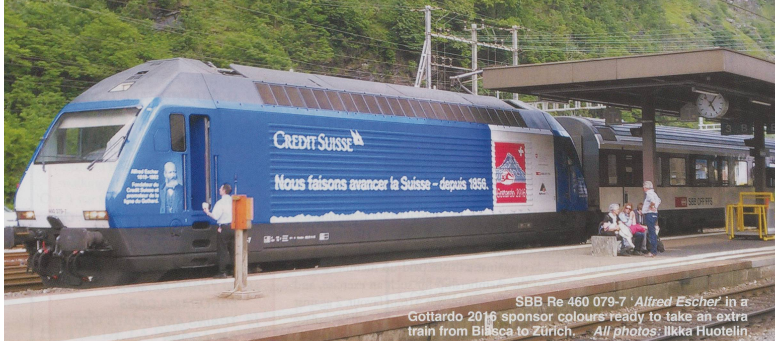
SBB Re 460 079-7 'Alfred Escher' in a Gottardo 2016 sponsor colours ready to take an extra train from Biasca to Zürich.

It took decades of debating, several referendums to get going and 17 years to build, so it was only natural that the Gotthard Base Tunnel opening would be big news in Switzerland. It was officially opened on 1st June followed by a special party for the 2,400 people involved in the construction, and on the following weekend there were a series of events for the general public, which I had a chance to attend. The opening party had been announced exactly one year in advance, followed up with regular updates in the media in the build up to the big day, and the attention it got was great across the whole country. The Swiss are typically very locally focused and not much interested in what happens elsewhere, especially across the language borders, but the official opening event was extensively broadcast live in the three different national languages, for the whole day. The Federal Government had spent CHF12m on the events, and if one counts expenditure by the Cantons, Communes and sponsors the total figure will be much higher.