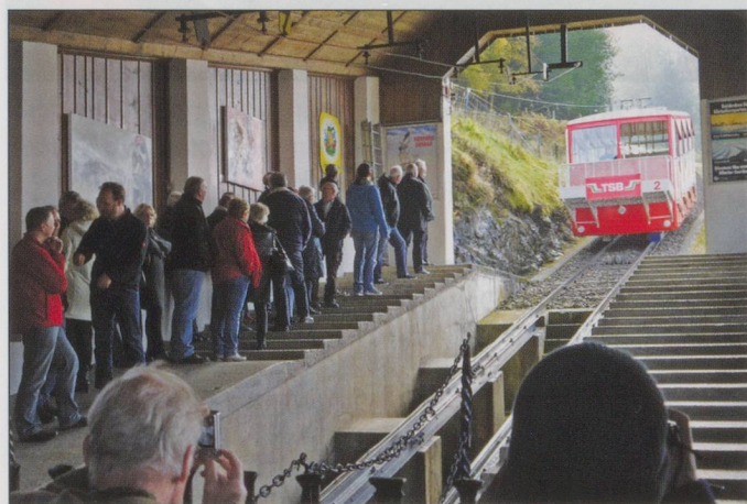
ABOVE: Lots of people visit Seelisberg and ‘Weg der Schweiz’ (“Way of Switzerland” for the 700-year-jubilee, opened in 1991).