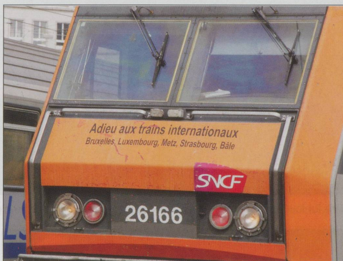
SNCF BB 26166 EC 96 IRIS BASEL BRUXELLES Dernier EC Voyageur Basel SNCF 02-04-2016.