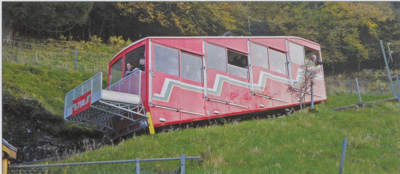
The funicular just outside the bottom station at Treib. Note the luggage rack on the bottom end.