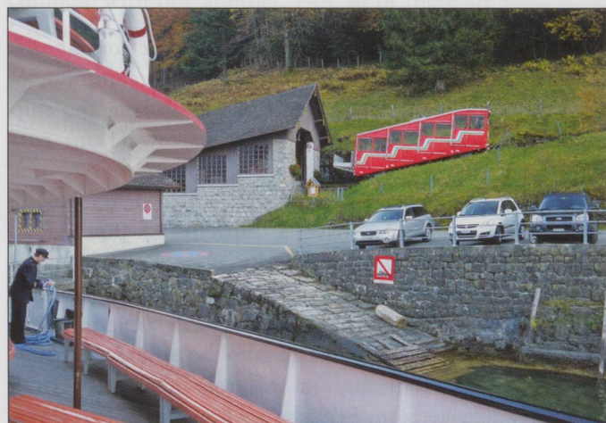
BELOW: Boat and funicular meet at Treib.