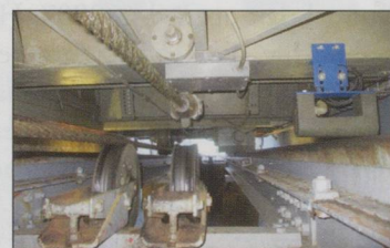
ABOVE RIGHT: The manoeuvring and moving parts of the two passenger cars are checked every day!