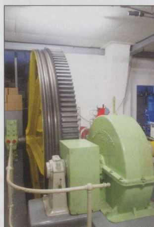
ABOVE LEFT: Full security for daily service: the engine is still in operation 100 years after construction!