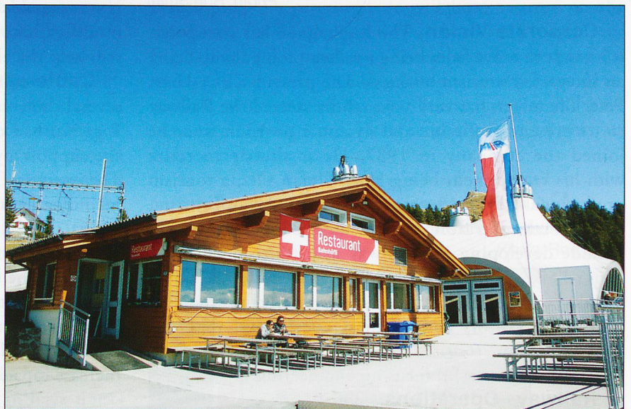
Bahnhöfli at Rigi Staffel.