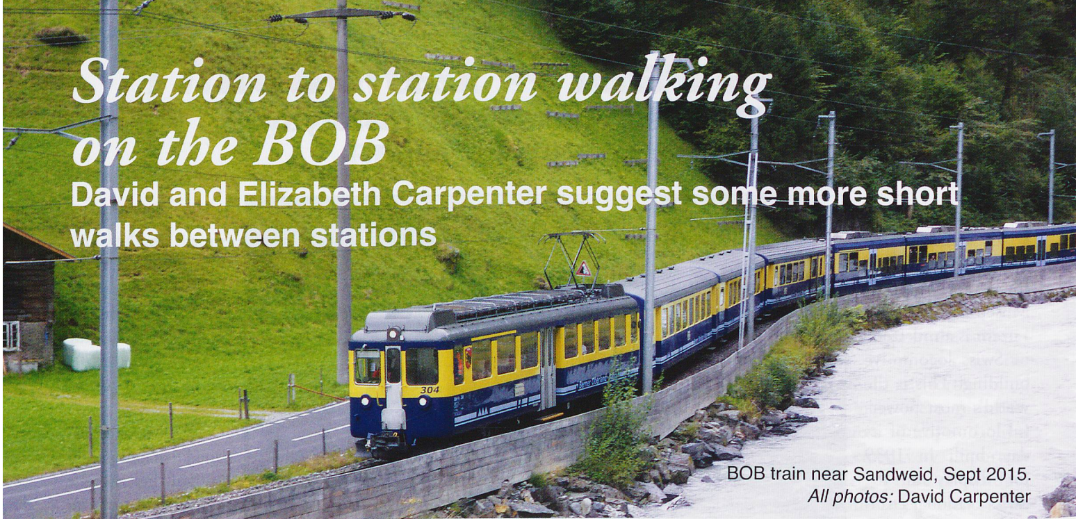
BOB train near Sandweid, Sept 2015.