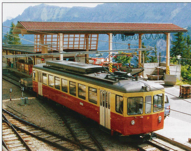
No.31 at Mürren.