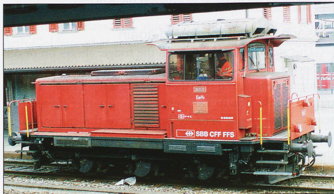
No. 18821 Em3/3 at Landquart 17 12 2009.

all be replaced by 47 Aem4/4 hybrid locomotives now on order from Alstom. These 4-axle multi-purpose locomotives will be powered either from an on-board diesel engine or from the o/h electric supply. The specification calls for 300kN tractive effort; 120kph maximum speed; 1600kW rating in electric mode; 900kW in diesel; up to 4 locomotives in multiple; centre cab and also remote radio control when in shunting use. Alstom has produced a modular design that may be of greater value to their sales department, as it is estimated the average age of medium range diesel locomotives on European railways was some 26 years in 2014. Many are much older.