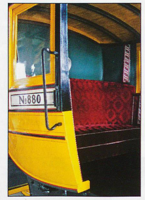
TOP RIGHT: Flüelen-Camerlata was the first direct way between south and north Switzerland.

to be the most photographed object in its collection and in recognition of both its historic and current status they arranged for the comprehensive restoration to take place. For this, the diligence was moved to the museum's repair depot at Affoltern am Albis (ZH) in summer 2015, where experts from the Luzern-based conservation and restoration specialist company 'Objektgerecht' were able to use their skills. The vehicle was then returned to greet visitors to its Zürich home at the end of July 2016. There are many locomotives and trains, plus the buildings and tunnels of the original Gotthard line, to recall the story of this historic route since 1882 – but there is only this original diligence to recall the movement of people and post before the opening of the railway.