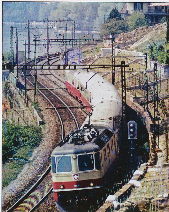
A 'Leman' TEE runs alongside Le Lemon in the early 1980's.

I took the 12.23 Milano-Genève, which was heavily delayed by a fallen tree near Stresa. I reached Genève Airport at 18.29, yet caught the 18.35 flight to Liverpool: a minibus was sent to take me out to the plane!