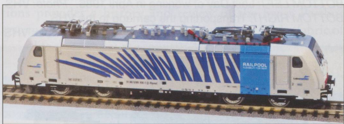
ABOVE: Railpool zebra-striped TraxX loco. TOP RIGHT: One of the Busch dioramas, showing their industrial system. BOTTOM RIGHT: One of this year's new models from the Swedish manufacturer NMJ. Not only are the models exquisite, I have it on excellent authority that they run very well.