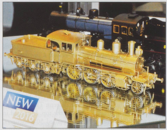
ABOVE: Railpool zebra-striped TraxX loco. TOP RIGHT: One of the Busch dioramas, showing their industrial system. BOTTOM RIGHT: One of this year's new models from the Swedish manufacturer NMJ. Not only are the models exquisite, I have it on excellent authority that they run very well.