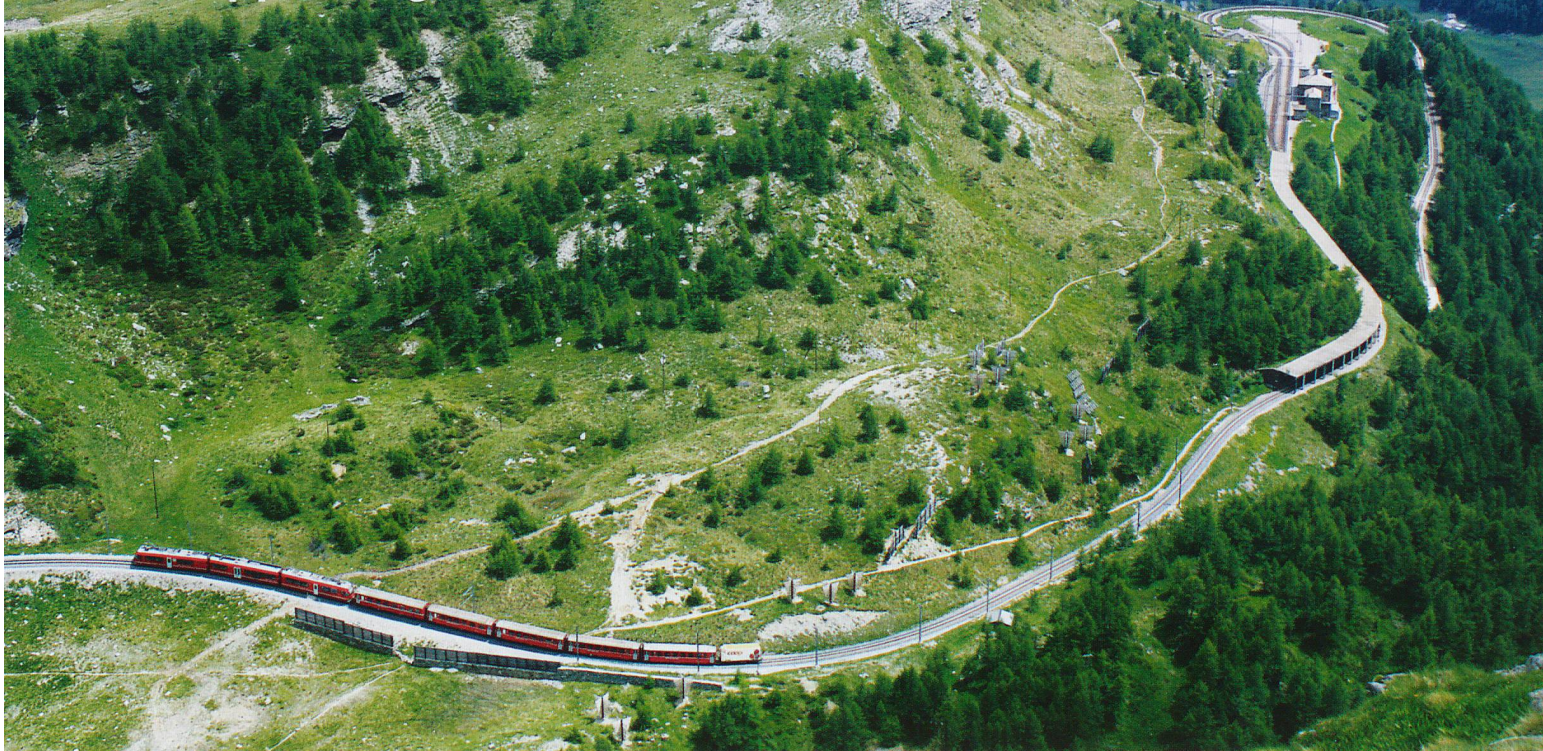
Alp Grüm from Sassal Mason along Walk 3.