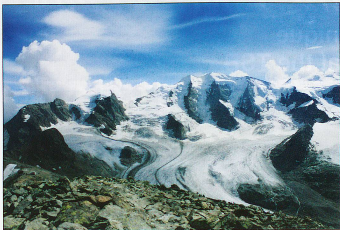
Piz Palü and Pers Glacier from Munt Pers.

mostly on a good path but with a couple of rocky sections (one short, one longer). Return by the same route and stop for a while at the Diavolezza refuge to drink in the stunning views of Piz Palü and Piz Bernina. Be warned, the price of drinks of the liquid kind here matches the altitude! You could walk up to Diavolezza, and/or down from it, but it's a rather desolate valley spoilt by the "ironmongery" of the cablecar pylons and by a bulldozed track, so I don't recommend it.