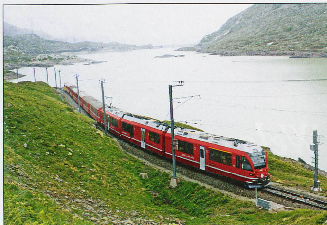
Train by Lago Bianco, near Bernina Ospizio.