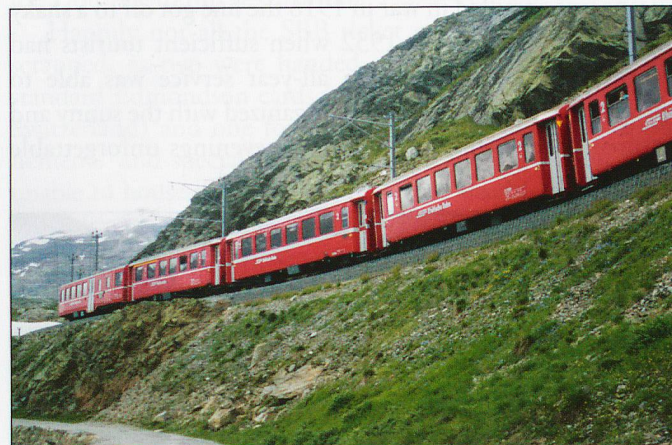
Train by Lago Bianco.

Four more walks follow in the next edition of Swiss Express .