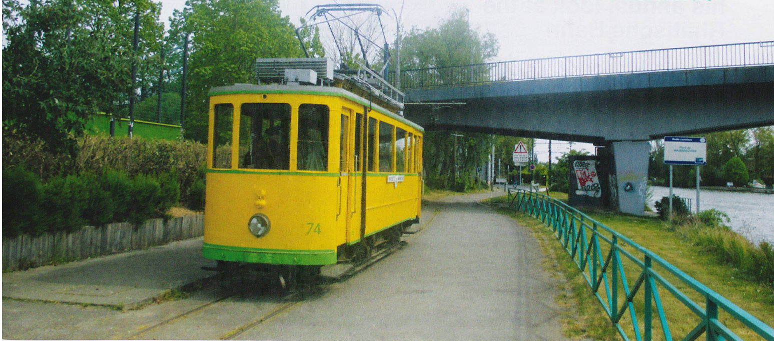
ABOVE: Neuchâtel No.74 waits at Wambrechies.