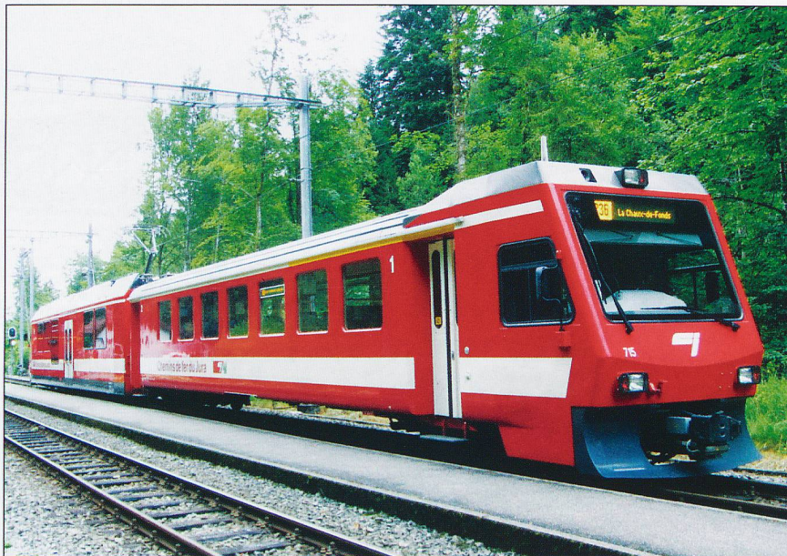
TOP: Combe Tabeillon station showing the trailer end of the train.