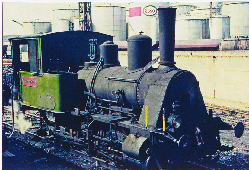
The old T3 0-6-0T shunter of the Schw. Reederei, replaced in the 70s by a Tigerli. (See photo in Part one)

After the war the port and its railway recovered steadily, with the harbour railway handling 2m tonnes by 1949. Cargoes were changing, and fuel oil and other raw materials displaced coal. After the 1970s containers became a staple load, replacing general loose cargo. Container gantries took over on the old coal quays. Railway operations reached