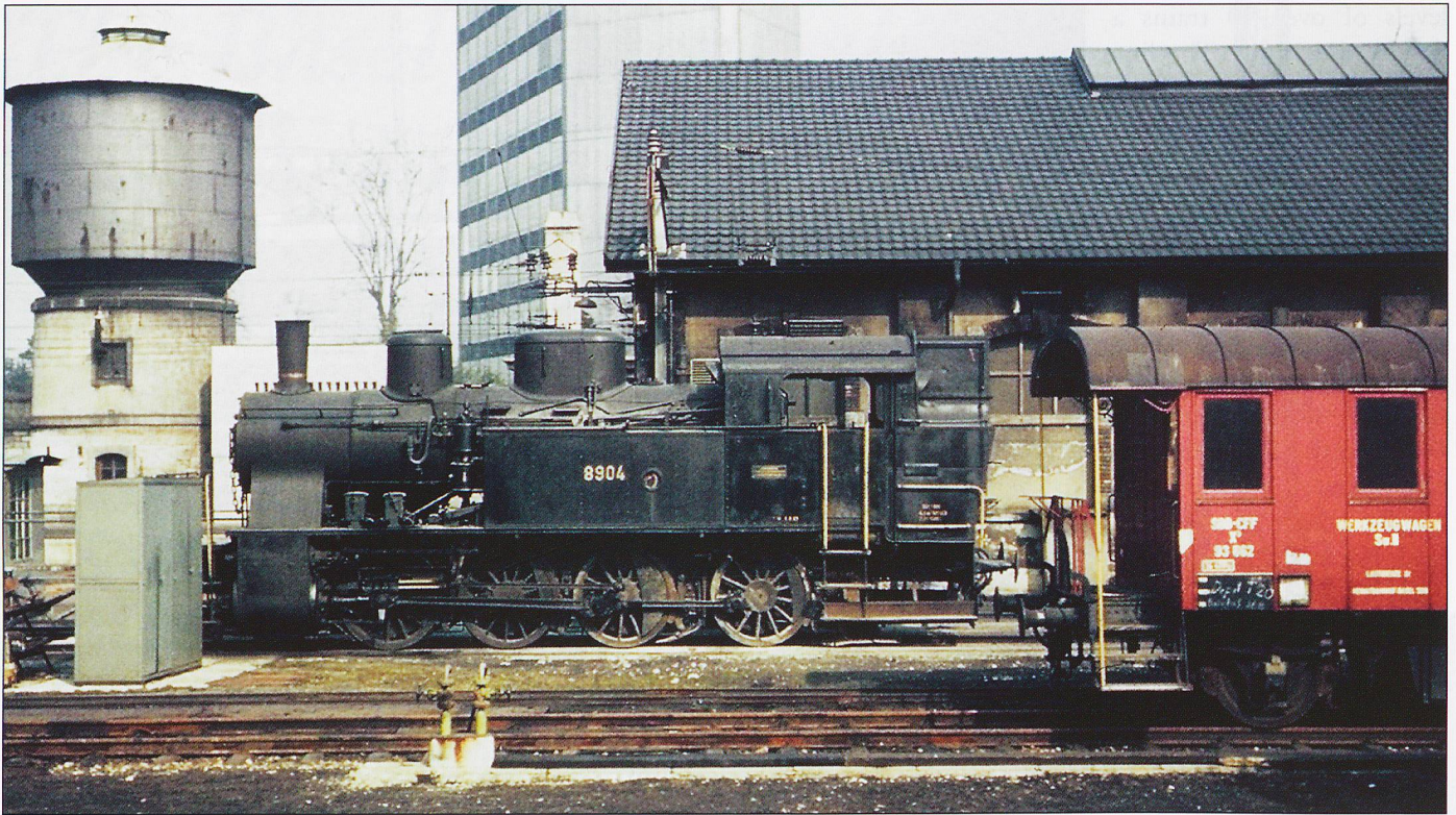
E4/4 8904 again seen at Basel shed (the old shed, Nauenstrasse, near the station), shortly before withdrawal 1968.

There are around 14,000-harbour traffic trains/year in and out. About 61% of the landside cargo is on rail. Much of the rest is containers, often local, by road, including many empty moves.