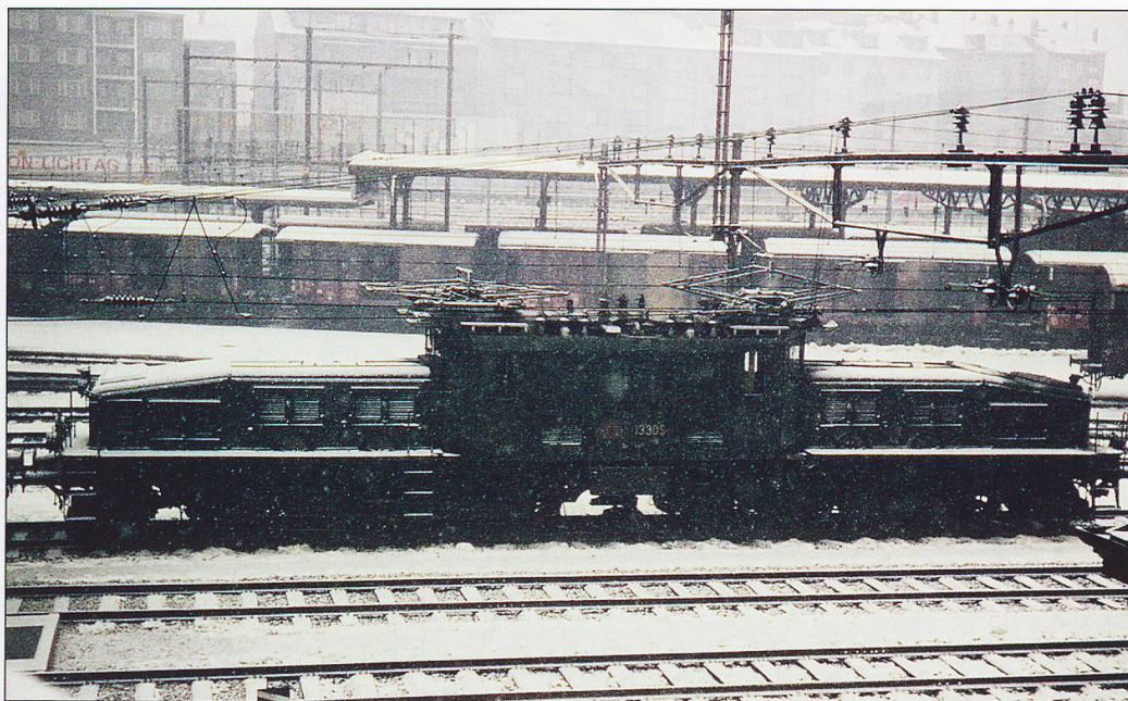
13305 at Basel SBB in the snow in 1969.

levels of over 50 trains a day by the 1960s. The line was steam-worked until its electrification in 1958, and often afterwards when electric locomotives were needed elsewhere. Lists of locomotives stationed at Basel, and old photographs, show that the C5/6 2-10-0s of the 2951 series moved in after displacement on the Gotthard route by electrification. They could handle 1,200t as a normal load, but at 25km/h at best. That no doubt assured the disturbance of the DB's shunting as noted earlier!