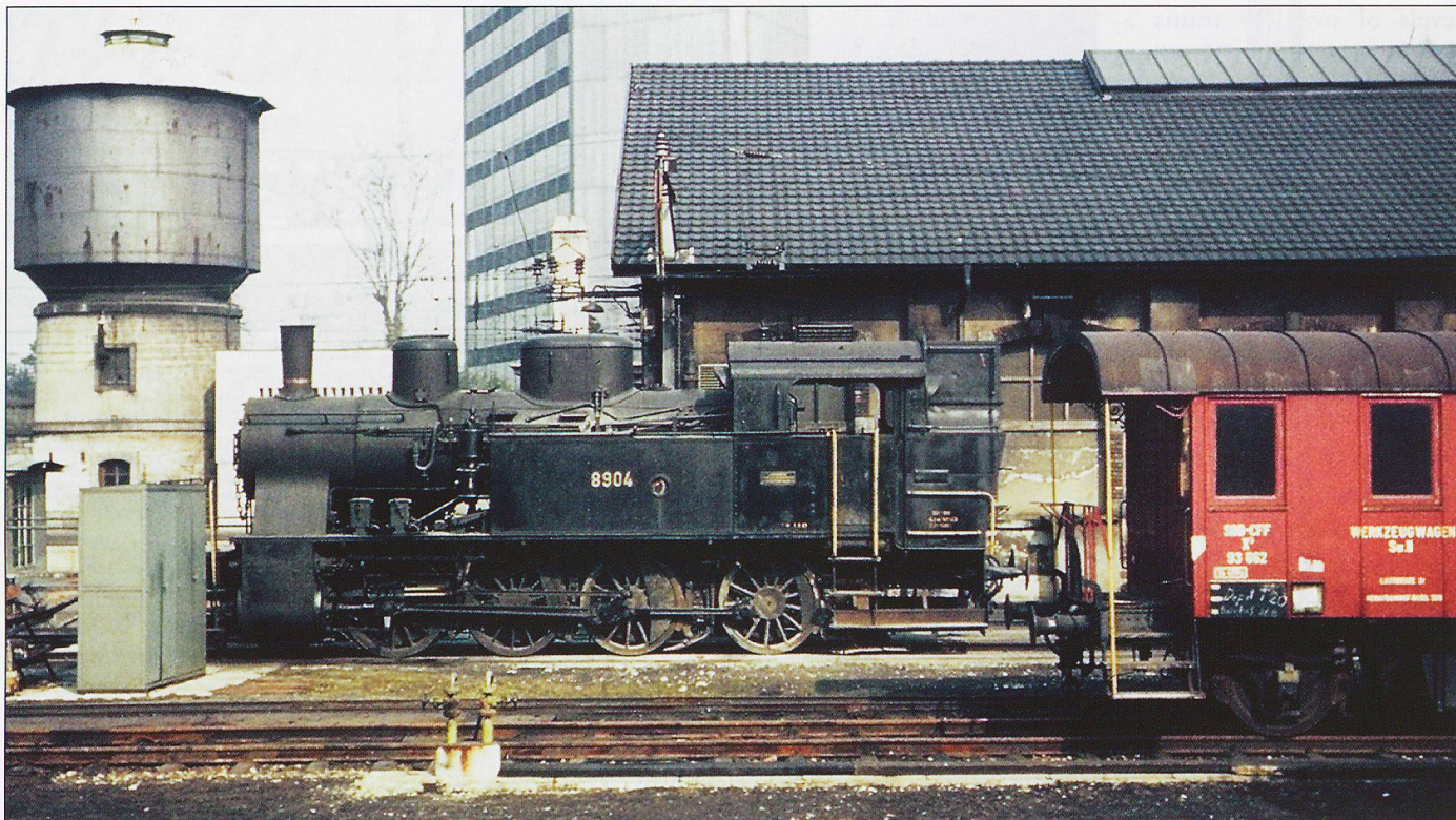
E4/4 8904 again seen at Basel shed (the old shed, Nauenstrasse, near the station), shortly before withdrawal 1968.

There are around 14,000-harbour traffic trains/year in and out. About 61% of the landside cargo is on rail. Much of the rest is containers, often local, by road, including many empty moves.