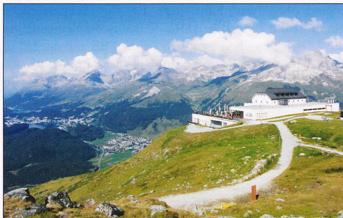
ABOVE: The hotel at the top.