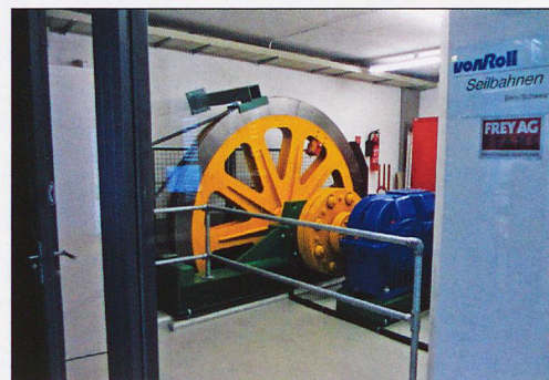
RIGHT: The funicular Cable Room.