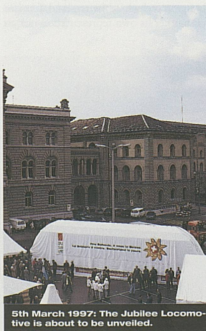
5th March 1997: The Jubilee Locomotive is about to be unveiled.

On 25th November 1997, at the International Catering, Hotel and Restaurant Fair in Basel, an important milestone was established as part of the quality offensive in Swiss tourism: the launching of the first national seal of quality. The «Quality Label for Swiss Tourism» is intended to increase quality awareness in businesses and to ensure quality of service in Switzerland as a holiday and travel destination. This quality project is being coordinated by Switzerland Tourism. The promoters of the project include the Swiss Tourism Federation, Gastrosuisse, the Swiss Hotel Association, the Swiss Association of Cable-Car Operators, the Union of Public Transport, the Conference of Regional Directors and the Association of Swiss Directors of Tourism.