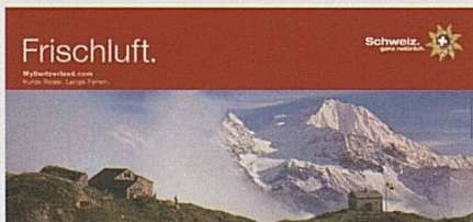
Central motives of the summer campaign 2003.