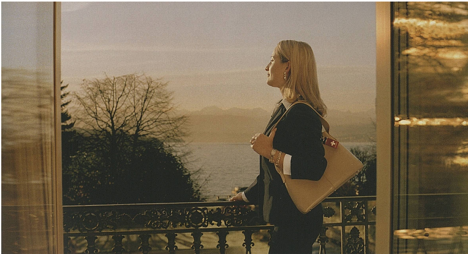
Central motif of the "Luxury & Design" campaign.