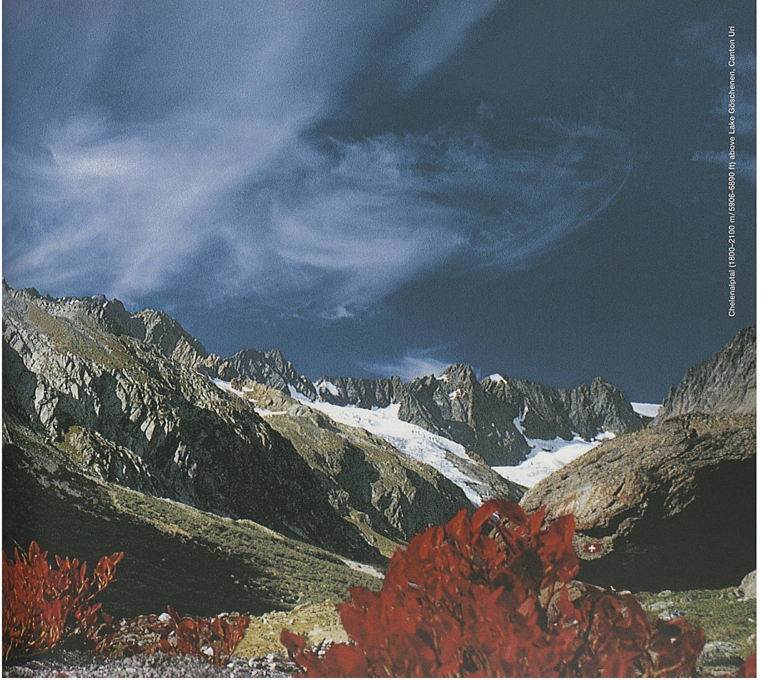
Chelmalpatal (1800–2100 m / 5906–6890 ft) above Lake Göschenen, Canton Uri