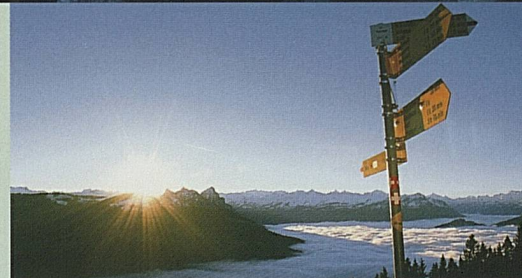
Rigi, Central Switzerland.