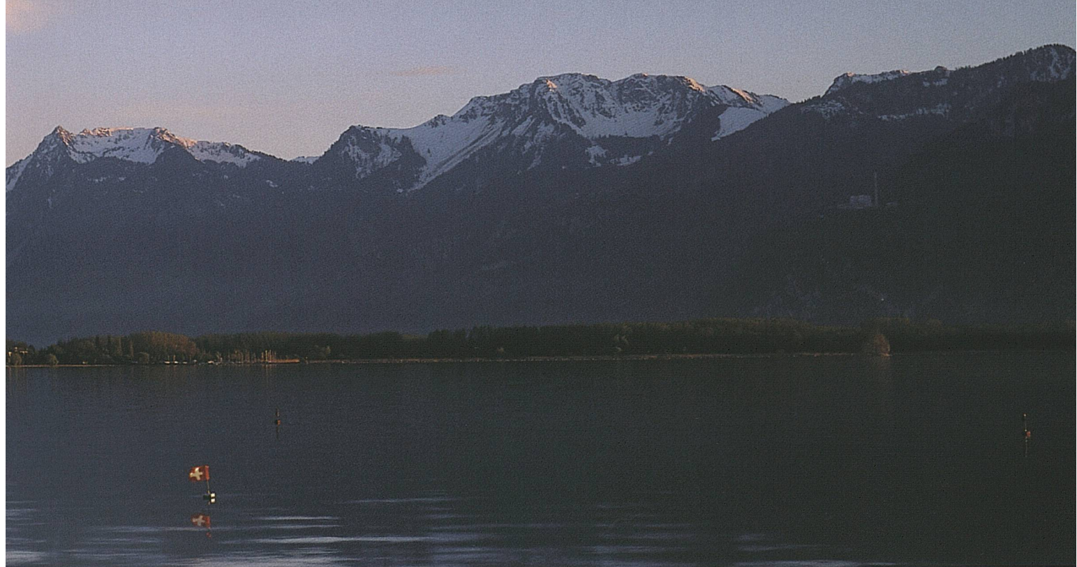
Evening ambience on Lake Geneva, Canton Vaud. Chillon Castle with the Dents du Midi mountains (3257 m/10 686 ft) in the background.