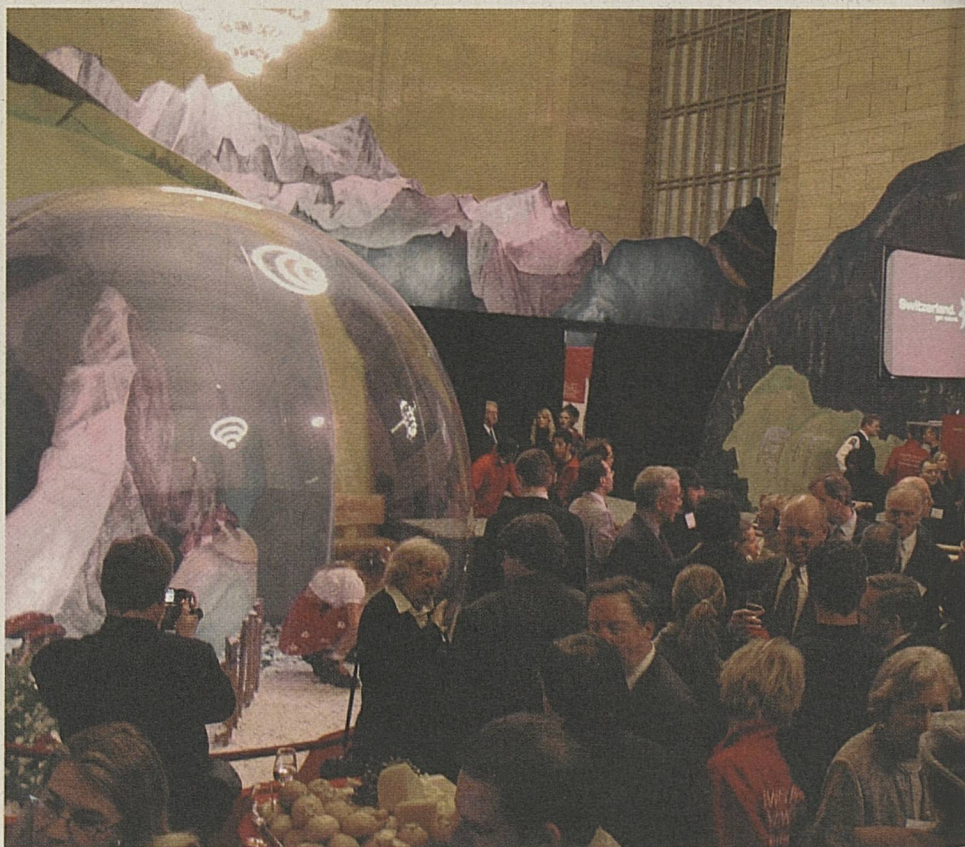
The miniature Switzerland was impossible to miss. Commuters could feel it, smell it, hear it – and buy it.

The media response was overwhelming. From the "New York Times" to the "Wall Street Journal", Switzerland was omnipresent, while the electronic media reported in depth from Central Station. A correspondingly large number of New Yorkers went to see the spectacle for themselves. The event can be adjudged a great success.