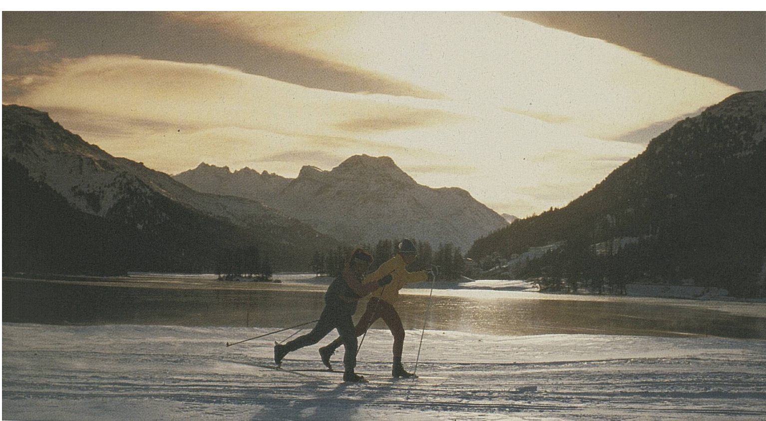
On Lake Champfer in Graubünden's Upper Engadine valley, time slips quietly by.