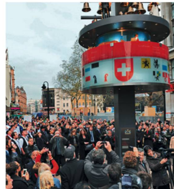
Inauguration of the new Swiss glockenspiel in London's Leicester Square.