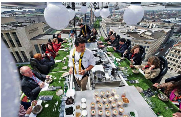
Heavenly dining experience: networking event "Dinner in the Sky" in Brussels with important decision-makers.