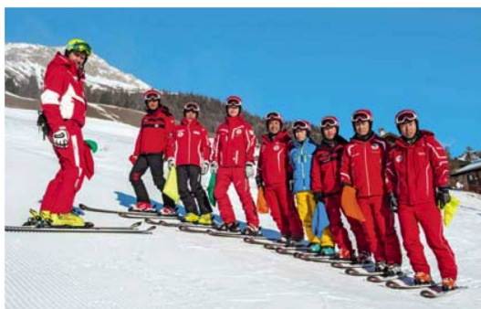
Chinese ski instructors training in Celerina, Graubünden.

Charming, high-spirited and tanned: on 26 October, 550 Swiss ski instructors from 75 winter sports destinations mingled with the public in Zürich, Bern and Lausanne, offering secret tips and stimulating interest in a Swiss winter sport adventure. 16,000 “myTop10” booklets were distributed to people in stations, shopping malls and pavement cafés. It was a well-received promotion by ST and Swiss Snowsports to mark the start of the winter season. The official winter launch followed two days later at media conferences in Zürich and Lausanne.