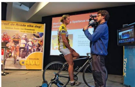
At the Spartacus media conference in Ghent, brave Cancellara fans measured up.