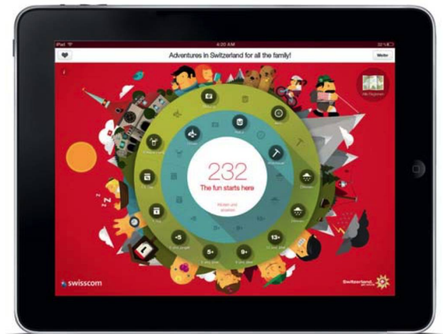
Multiple awards at "Best of Swiss Web 2013": the "Family Trips" app by ST and Swisscom.

"Family Trips" is as spontaneous and full of surprises as everyday family life. This multi-award-winning app for mobile devices was developed by ST and Swisscom to promote Switzerland for family adventures. Beneath a brightly coloured user interface, it playfully presents 1,200 family adventures. With filters such as "weather", "age of children" and "duration", the tips can be sorted to suit everyone's needs. The app has been downloaded a total of 70,000 times.