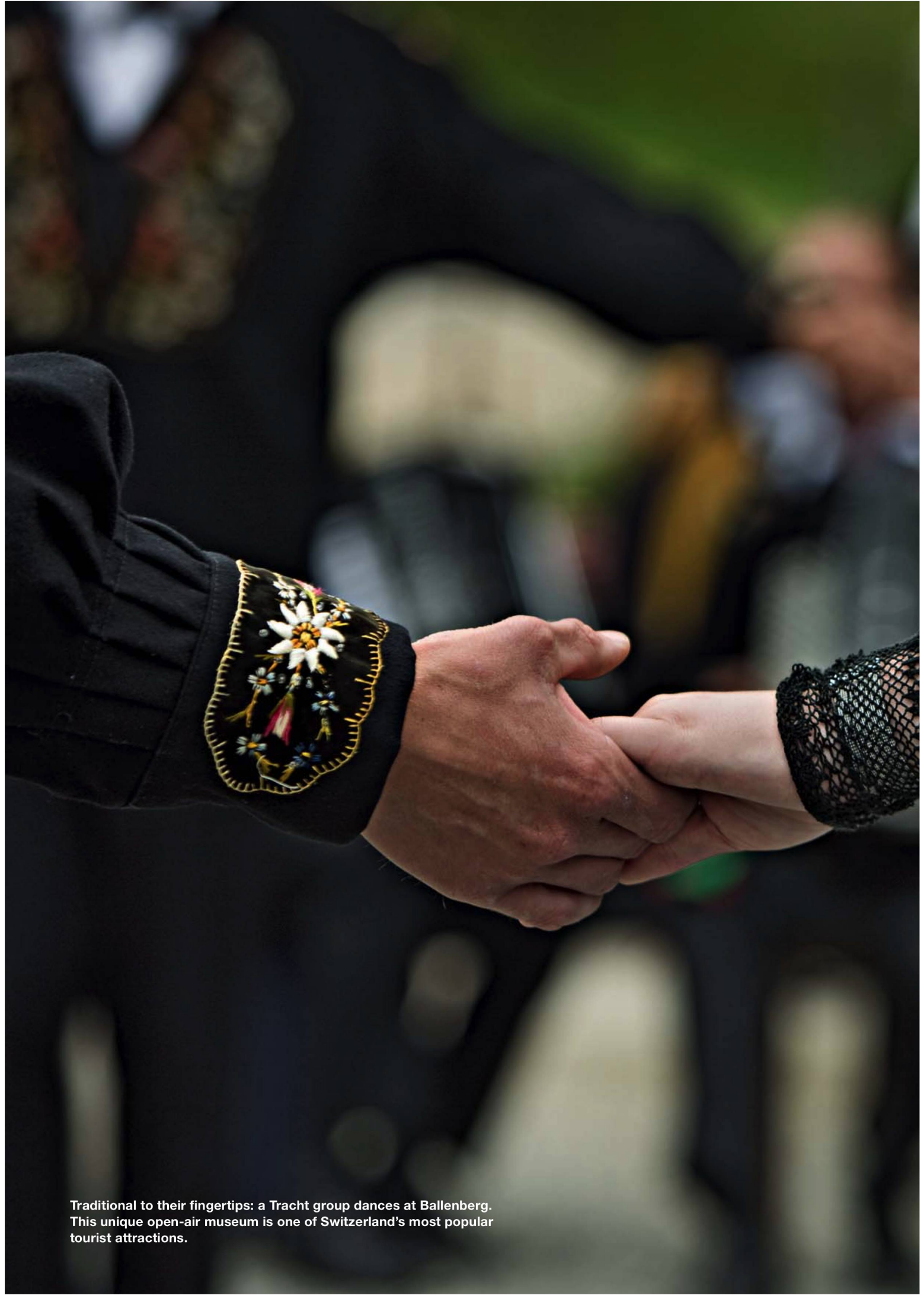
Traditional to their fingertips: a Tracht group dances at Ballenberg. This unique open-air museum is one of Switzerland's most popular tourist attractions.