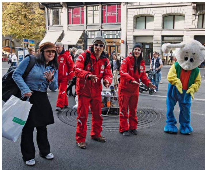
Popular campaign for the start of the winter season: Swiss ski instructors in Zürich offer secret tips.

When it comes to winter, our ski instructors are the top experts. They know the most beautiful downhill runs, the hippest après-ski bars, the cosiest fondue spots and the loveliest chalets. Seven of them gave away their personal secret tips in the booklet “myTop10”, enriched with “augmented reality” (see page 39), in the form of additional interactive and multimedia information on mobile devices with ST’s app Swiss Extend. Visitors could also upload their own tips at MySwitzerland.com/mytop10 . This promotion sparked much interest: the myTop10 microsite had generated 616,000 site views by year’s end.