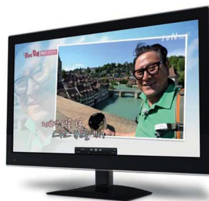
Enthralled Koreans: TV show "Gramps Over Flowers".