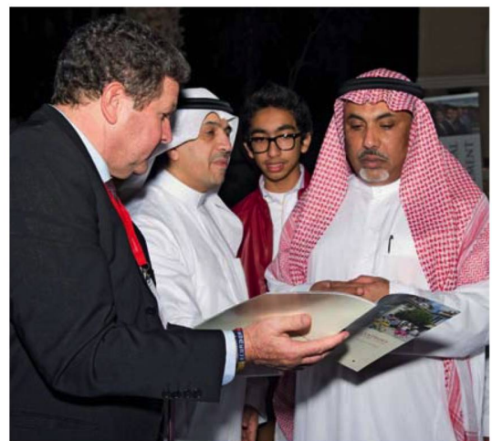
Arab tour operators at a Switzerland workshop.

For three days of wellness, fine dining and heavenly driving roads, Porsche invited 11 Italian automotive journalists on a media trip through Switzerland. ST took care of the programme, which fitted the Porsche image perfectly. The journalists ended up suitably impressed by both Porsche and Switzerland. The articles published up until the end of 2013 reached 4.2 million readers; further stories are planned. ST made important new media contacts.