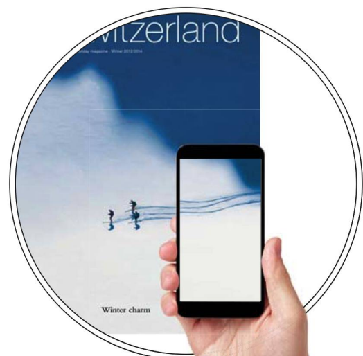
Thanks to ST's app Swiss Extend, a magazine becomes a film.