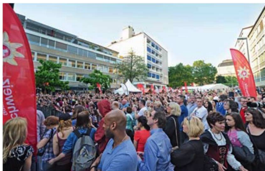
Great interest in Switzerland: the street fair in Wiesbaden.