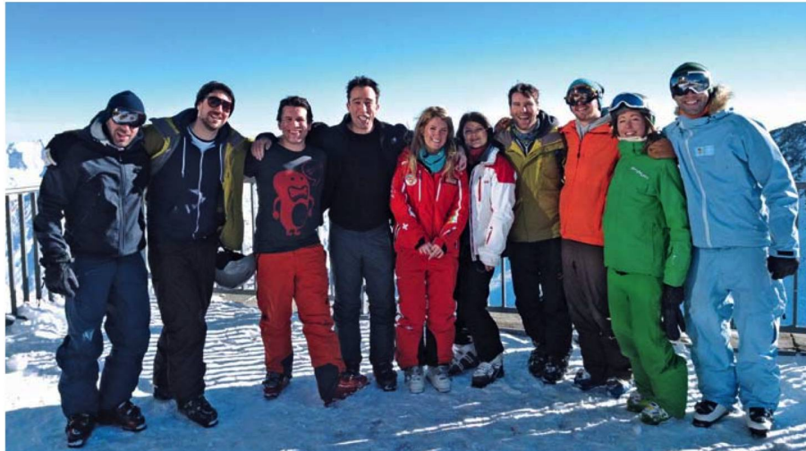
The Absolute Radio crew visibly (and audibly) enjoying Switzerland.