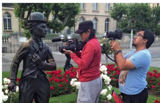
Charlie Chaplin in their sights: a Malaysian TV shoot in Vevey.