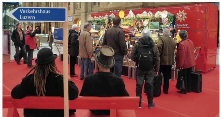
Focusing on urban culture: ST at the Leipzig Book Fair.