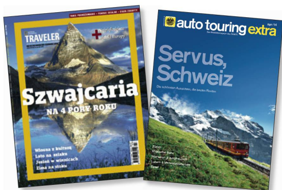
Close cooperation with ST: special issues on Switzerland in Polish and Austrian magazines.

In May, the celebrated Indonesian TV chef Juna travelled through Switzerland with ST. Along the way, he cooked local Swiss dishes for his show "Arjuna" on Global TV. This was the first time ST partnered an Indonesian TV show for a large-scale tourism project. Juna's team filmed 28 episodes in Switzerland, reaching an audience of eight million people.