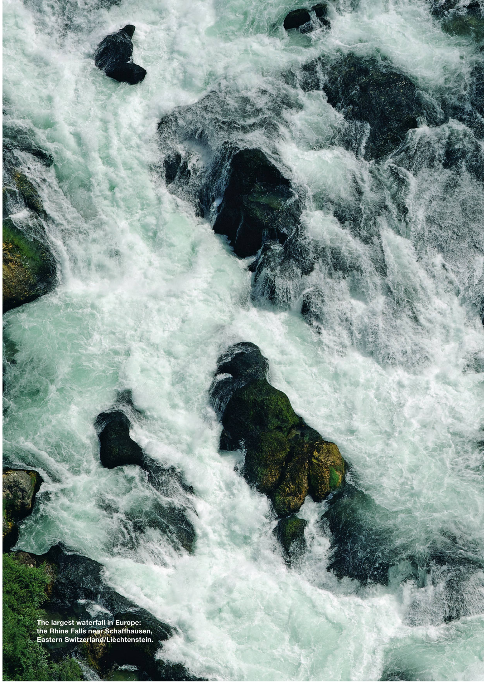
The largest waterfall in Europe: the Rhine Falls near Schaffhausen, Eastern Switzerland/Liechtenstein.