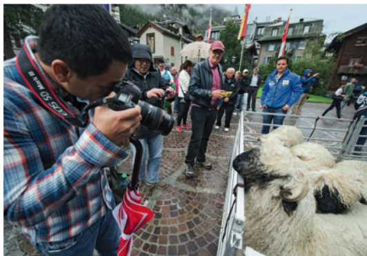
Woolly ambassadors: Zermatt blacknose sheep.