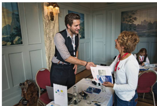
Winter workshop in The Hague's Koninklijke Schouwburg.

Legendary Californian producer and director of spectacular skiing and snowboarding films Warren Miller included sensational Swiss imagery in his most recent work "No Turning Back". Through ST's efforts, Swiss landscapes, as well as our partners SWISS and Mammút, are present in ten of the film's 90 minutes. Thanks to integrated marketing ST was able to strengthen the US image of Switzerland as a preferred winter destination to an audience of around 150,000.