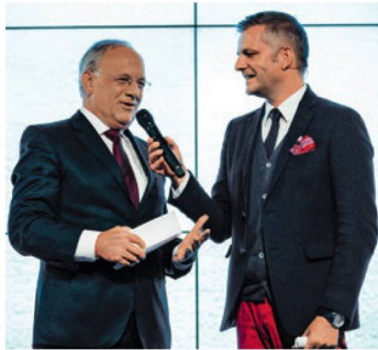
Federal Councillor Johann Schneider-Ammann at a VIP event at Jelmoni.