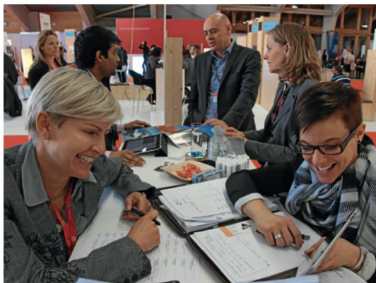
The first STMS led to 125,000 additional overnights.

ST and the exclusive Zurich department store Jelmoni celebrated winter with a three-week special promotion, including exclusive evening events. Various ST partners were involved, running presentations for visitors. ST also distributed 13,300 brochures and 20,000 postcard sets. Jelmoni also marked the anniversary in their own winter magazine, which has a run of 124,000 copies and reaches a readership of 310,000. Jelmoni received 400,000 customers over the three weeks.