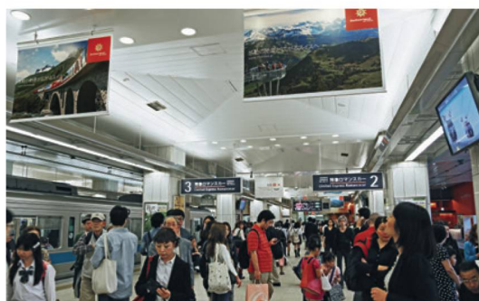
ST posters in Shinjuku train station: it holds the world record for the most passengers.

In conjunction with ST, Coop produced a joint summer insert with 75 accommodation deals over 70 pages. They covered all of rural and alpine Switzerland, and also featured excursion tips from experts. Coop proved to be an ideal partner: the Coop paper reaches nearly two-thirds of all Swiss households, with 2.7 million copies and 3.6 million readers. This summer insert generated over 18,000 overnights, 6,000 more than in the previous year.