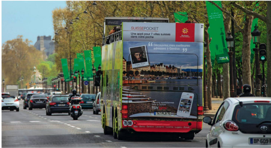
ST advertised its popular "SuissePocket" app on buses in Paris.