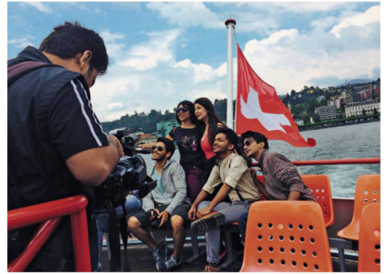
On track: the "Swiss Made Challenge" was well-received in India.

In conjunction with SCIB and the Polish Association of MICE Organisers, ST Poland invited five partners and around 28 participants from the MICE sector to a workshop in Warsaw, in order to present the advantages of Switzerland as a conference venue. This workshop, the first of its kind, met with high demand: ST sold around 1,000 additional hotel overnights.