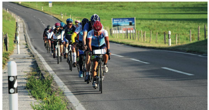
In Hong Kong they're discovering cycling – with Switzerland's help.

Good-looking, entertaining and keen for adventure: that describes the seven winners of a contest on the Indian lifestyle channel NDTV Good Times. They qualified from a pool of 76,000 hopefuls for the reality show "Swiss Made Challenge". ST organised their trip, complete with bungy jumping, raft building and abseiling down a glacier crevasse. 410 million viewers followed their adventures. Twitter recorded 372,000 interactions; Facebook over 1.2 million.