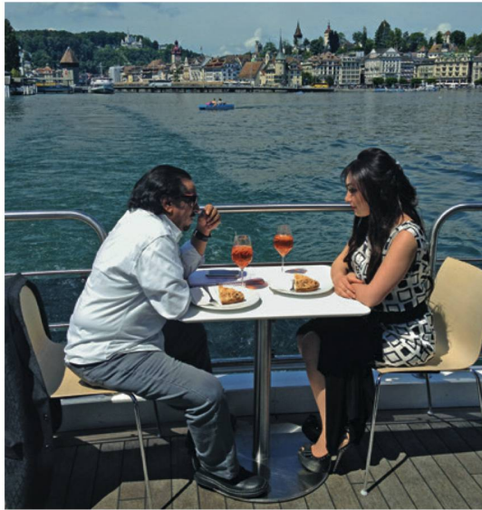
The best advertisement for Switzerland: Arabic TV stars in Lucerne.