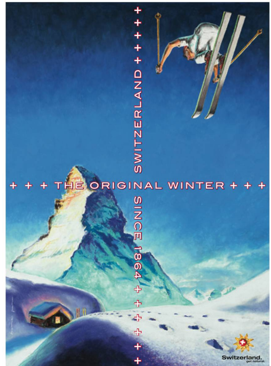
Totally retro: the anniversary poster by Matthias Gnehm.

In order to position the Swiss winter early for new markets, ST organised the first "Snow Travel Mart Switzerland" (STMS) in St. Moritz in March. The results were positive: ST brought together Swiss tourism providers with 180 buyers from 44 countries, 26% of them from strategic growth markets. Thanks to STMS, around 125,000 additional hotel overnights were sold, which represents revenue of approximately CHF 31 million.