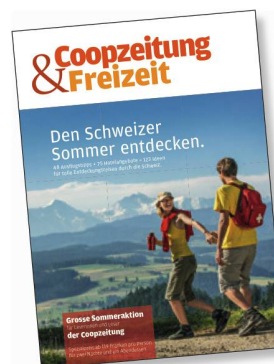
The Coop paper delivers: ST's summer special.

Poland's "National Geographic Traveler" published a special issue on Switzerland for the first time. The renowned travel magazine, with a readership of 480,000, devoted 132 pages to Switzerland – and its publishers, Burda, also promoted Switzerland in some of their other titles, with a circulation of two million. Switzerland was also the main topic in "Auto Touring Extra", a magazine from the Austrian Automobile Association (ÖAMTC). ST generated 500,000 media contacts in Austria.