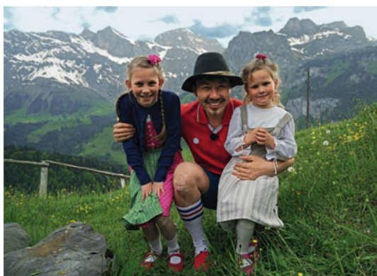
Heidi feeling: entertainer Noh Hongchul in Engelberg.