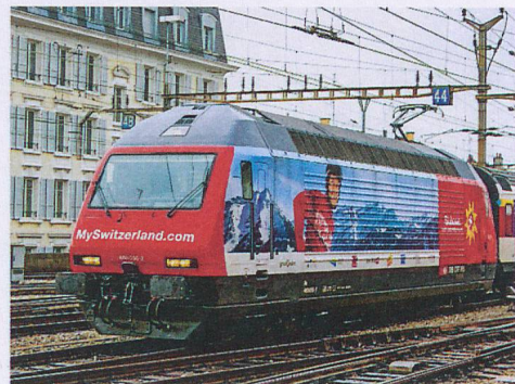
Strategic partnerships: exploiting synergies and taking the image of Switzerland out into the world together.