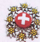
First design for the golden flower