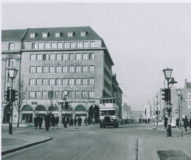
Switzerland House in Berlin: firmly in Swiss hands, even during World War II.