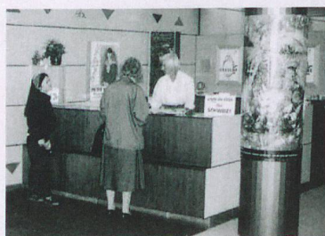
The SNTTO opened a new office in Stockholm , to market Switzerland as a holiday destination in Scandinavia. After a short break, today Switzerland Tourism once again has a presence in Sweden.