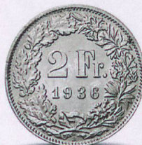
In light of the economic situation, the government devalued the Swiss franc.