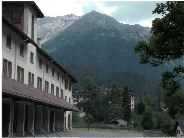
Kurhaus and Arsenal, Bergün, photo by Florian Schrott, 2005.

forthcoming owners, and the Kurhaus as well as the village of Bergün (see “Municipality of Bergün”), situated on the formerly important “Albula” alp transit route, fit the theme perfectly as both were in the middle of a process of transition and redefinition.