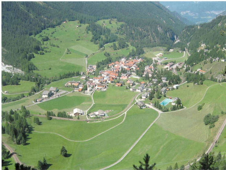
Bergün , aerial view, state 2005, photo by Edvin Bylander.