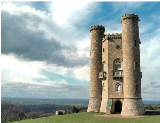
Garden Folly: James Wyatt, Broadway Tower, Cotswolds, 1797, state 2004