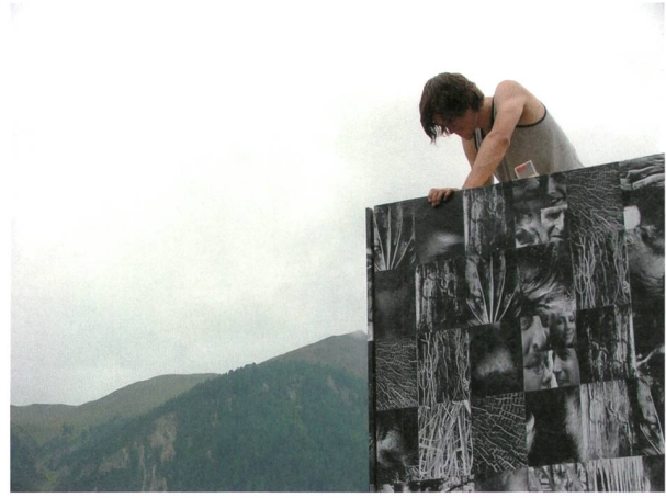
Workshop participants, Folly Suisse , construction photo, Bergün, 2005.