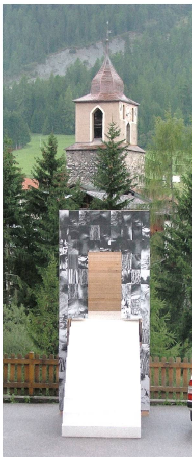
Workshop participants, Folly Suisse , Bergün, 2005, photo by Benedikt Boucsein.