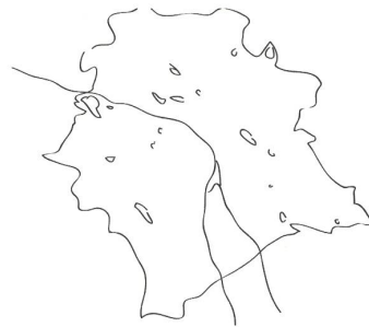
Bund 18 - fig. b map of the city of Zurich red: allotment garden areas

Aggregated shacks with neither electricity nor toilets, situated between highway and train tracks, on oddly shaped plots; sprawling out over sloping hillsides and cast to the outskirts or outlying industrial areas of a city – the definition of a slum. Or is it? Though densely concentrated, this cluster of shacks constitutes anything but a slum. In actuality, it is a collection of land plot designated for the purpose of garden sharing in a city. These allotment gardens are referred to in Zürich as Schrebergärten. 1 A far cry from slums, these highly coveted little segments of land are outfitted with what are in fact not shacks, but rather garden sheds that often belong to the city's upper crust. Despite – or because of – the attractiveness of these allotment gardens, they are increasingly coming under pressure to justify their existence into today's ever-expanding urban development.