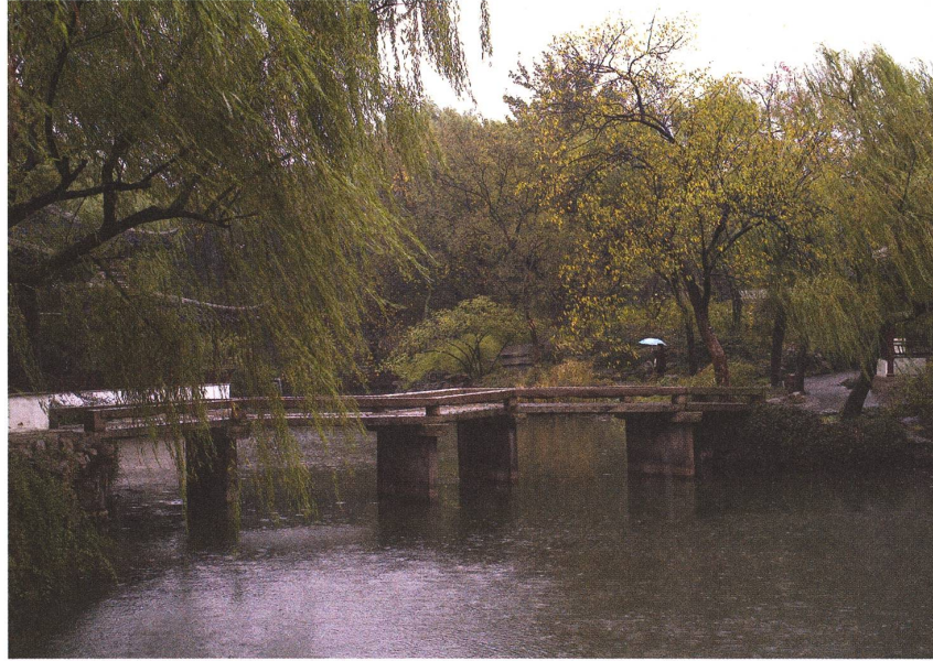
fig. a Figure standing by a rain swept bridge in the wind, Garden of the Humble Administrator in Suzhou.

traditions. Each garden, is considered as a fragment of the whole, and understood also as a figure of virtuous human conduct. It is the moment when garden aesthetics meet Confucian precepts of ethics, virtue and courage imbedded in rock outcroppings and pine trees, obvious symbols of endurance and longevity. 2 Each plant and rock is precisely placed to exude a meta-meaning in the garden. The spatial realm created by the Oriental garden is spherical and atmospheric in figuration and its dynamic comes across to the Western eye as being non-directional. The all-encompassing beauty of this figure unfolds for the visitor only at the heart of the garden. The human subject is thus always imagined as inhabiting the landscape, symbol of