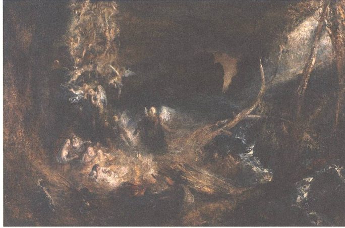
fig. b Joseph Mallord William Turner, The Vision of Jacob's Ladder, ca. 1830.

perceives the equation. He visualizes it in a different way which helps him to go beyond just developing the mathematics. There is a big difference for me between physics and mathematics. Mathematics develops certain formalisms, in physics you have to get a vision of what you want to do and then in a sense, language is secondary. Einstein for example had this vision. It was very clear for him what general relativity should be. And then he spent years and years in trying to develop the mathematics, in which by the way he wasn't the strongest in the world. He actually had to discuss with many mathematicians in order to find an expression. But he really was the one with the vision. It is about trying to visualize in other terms, find analogies which are simple and well known. You need to find the vocabulary that translates a concept from a messy problem to a simple and known concept. Once you know this you know what to expect and how to develop your story further.