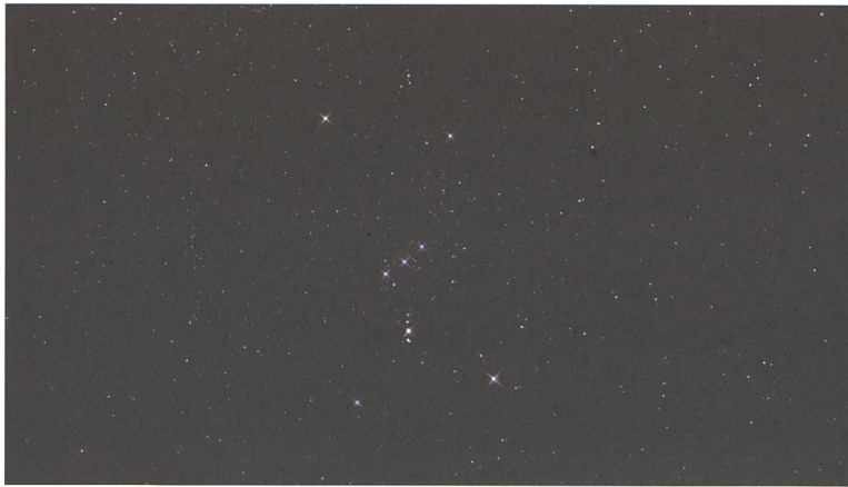
fig. d the Orion constellation

During the last centuries philosophers of science explored the question of colour realism and searched whether colour is subjective, objective, physical, physiological or psychological. Even though colours could be perceived at a first naive glance as a physical property of the objects or as a creation somewhere in the brain, I would rather state that colours are showing us that one thing is different from another. Colours help us to differentiate, leading to an observed diversified world. They tell us about the seasons and the cycles of life. They show us the laws governing the reality we inhabit and finally they let us survive.