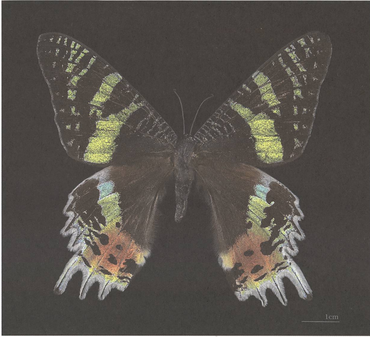
fig. a Chrysidia thipheus, photographed by Didier Descouens