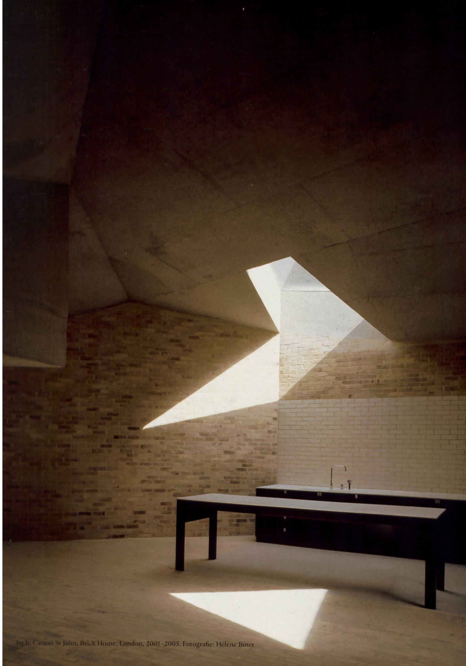
fig.b: Caruso St John, Brick House, London, 2001–2005.