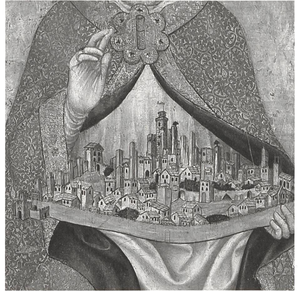
Taddeo di Bartolo, San Gimignano enthroned with eight stories of his life , 1401

Yet, images are always held by someone—commissioner, painter, photographer—from beneath, in a concealed manner. The holders evaporate, leaving the ‘beholders’ unaware of the genesis of the discourse they are subjected to. As W.J.T. Mitchell puts it in Iconology: Image, Text, Ideology , «the effect of this invention was nothing less than to convince an entire civilization that it possessed an infallible method of representation, a system for the automatic and mechanical production of truths about the material and the mental worlds.» (7) Humans, then, as image-bearers, using them as screens saturated with ideological statements, acting as interfaces between their inner world and the external world they conquered and own.