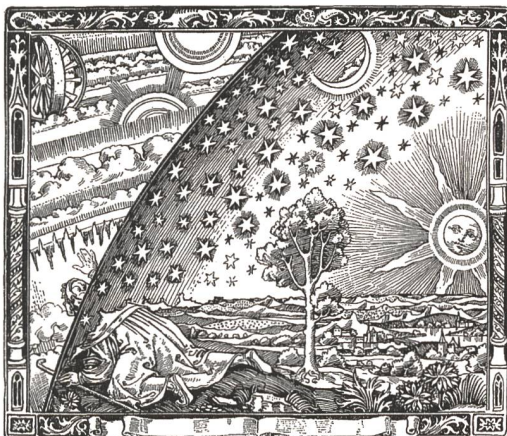
Camille Flammarion, L'Atmosphère , illustration of Météorologie Populaire , 1888

«Images are not just a particular kind of sign, but something like an actor on the historical stage, a presence or character endowed with legendary status, a history that parallels and participates in the stories we tell ourselves about our own evolution from creatures ‘made in the image’ of a creator, to creatures who make themselves and their world in their own image.» (4) Images as pieces, fragments bound together to produce reality, a greater image, a «state of affairs» full of discourses, loaded with utterances, a voice that arises from all the mixed choruses emitted by our icons.