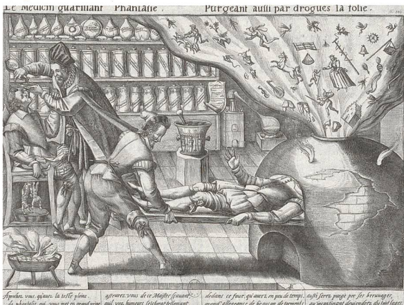
Matthaeus Greuter, Le Médecin guarissant Phantasie , circa 1600

A play of projection, perception and re-projection, by all of us, constantly, where images as veils move from the outside in, from the inside out, and back again, in a constant and mutual dialogue between physical object and conventional image, until one does not know anymore where it started.