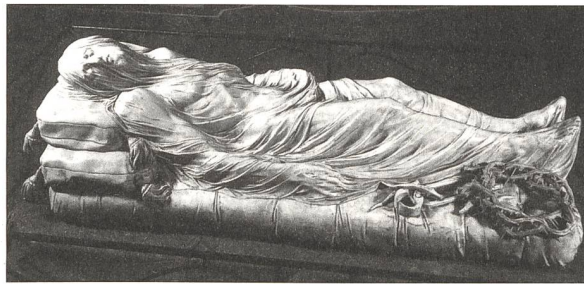
Giuseppe Sanmartino, Cristo velato , 1753