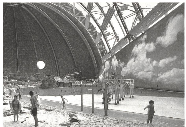
Tropical Islands Resort, Krausnick, Germany.