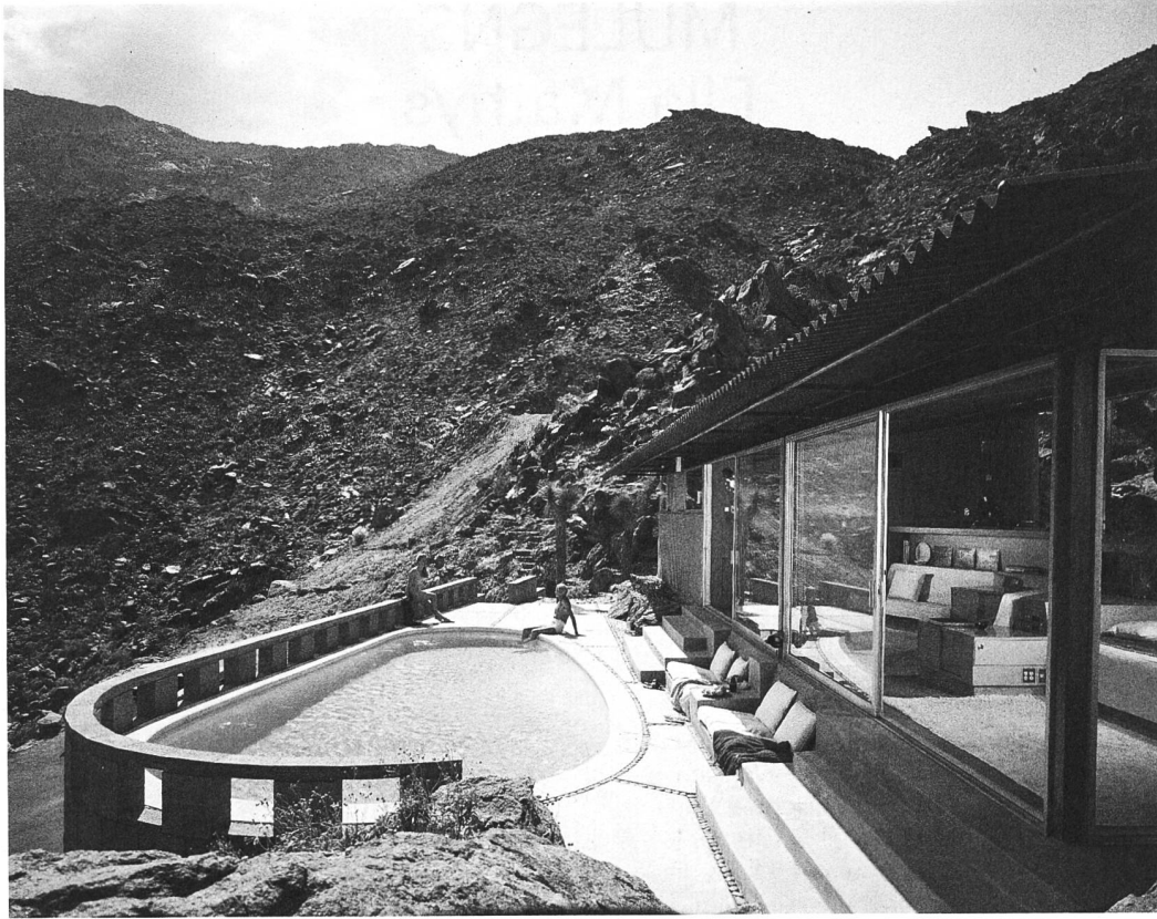
Albert Frey, House II, outside view on pool