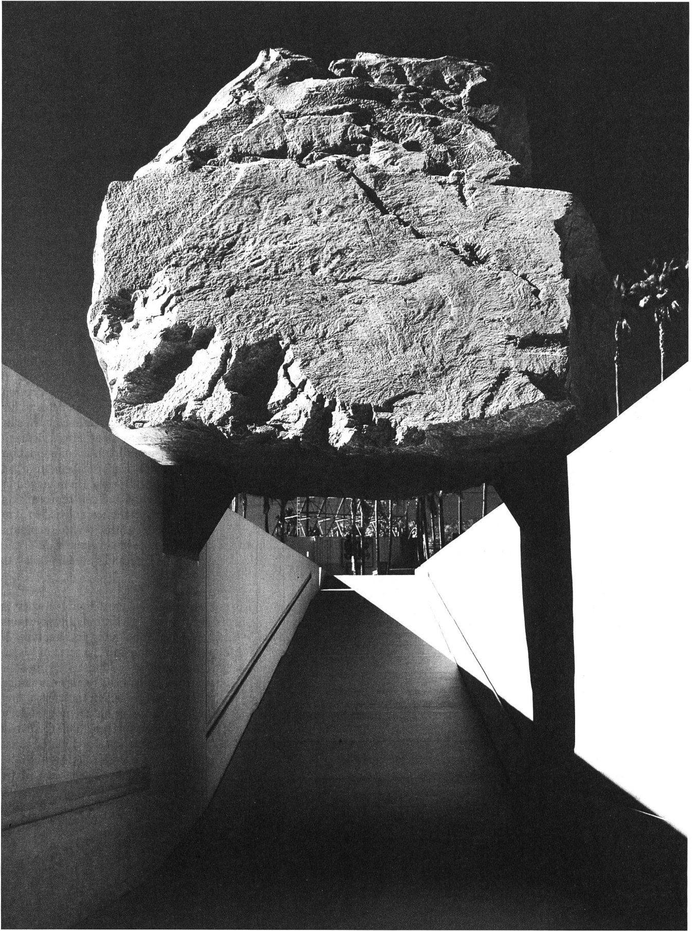
Michael Heizer, Levitated Mass Los Angeles County Museum of Art