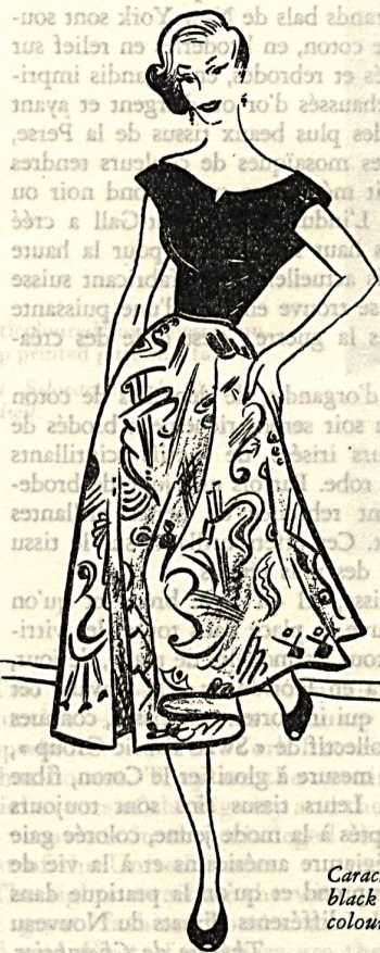
Characteristic line of this season: black bodice and skirt with bright colours on a clear background.

Let us take, for example, the field of printed fabrics.