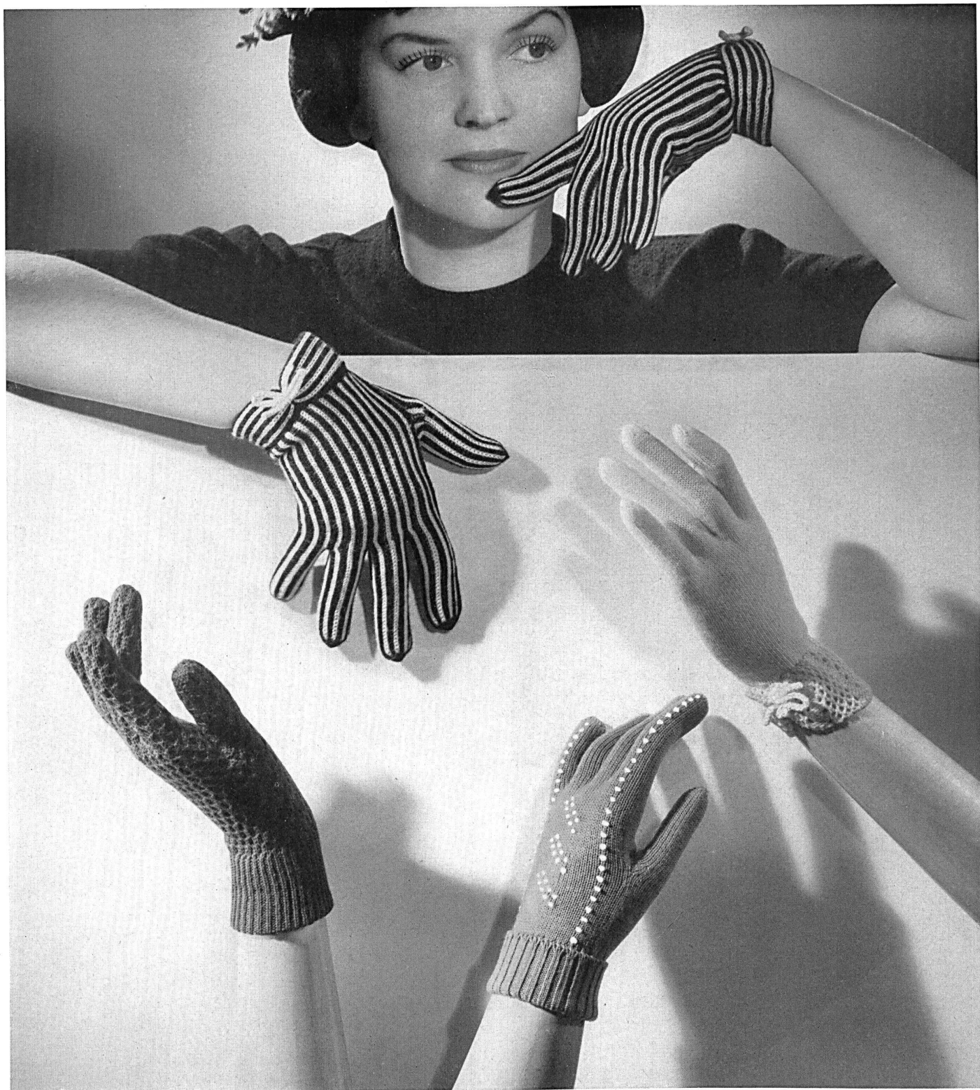
E. Frey-Gätzi S. A., Degersheim Gants de laine tricotés, pour dames. Knitted woollen gloves for ladies. Guantes de punto de lana, para señora. Gestrickte wollene Damenhandschuhe.