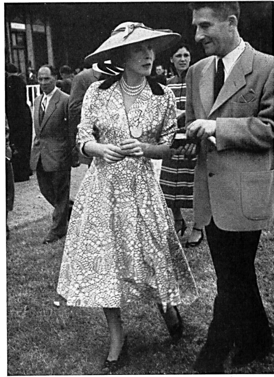
Chantilly : Prix du Jockey-Club. Une robe en imprimé qui fut fort remarquée.

At the opposite side, at the Porte d'Auteuil, buses of all sizes wait patiently for the passengers drawn by the shouts of the drivers : « Clichy... Porte des Lilas... Nation... » Like an egg breaking in two, Auteuil has disgorged on one side all the elegance of the enclosures and the grand stands, and on the other the masses from the public enclosures.