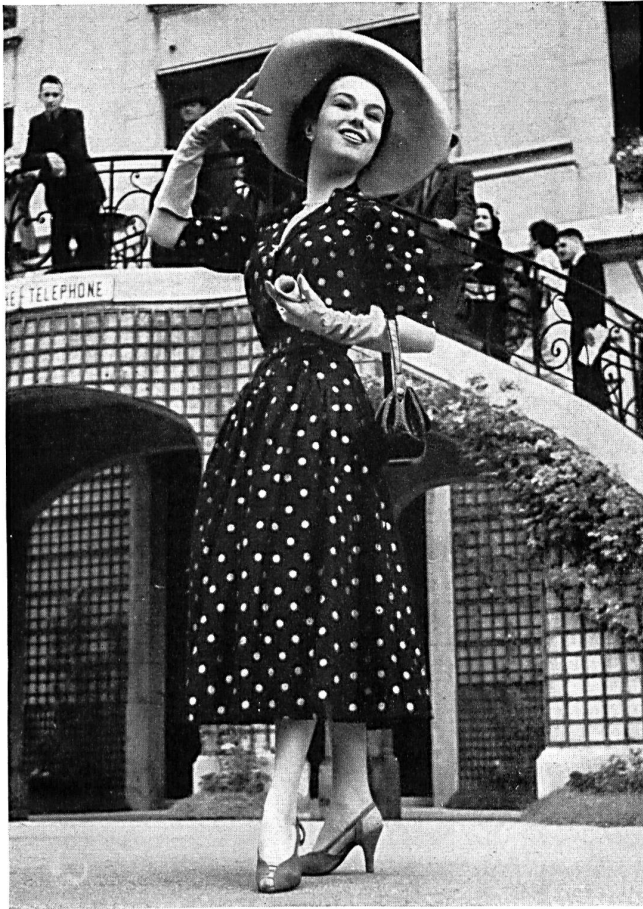
Auteuil : Grand steeple-chase. Robe de Maggy Rouff.

almost identical jackets go off towards the start at the Carrefour des Cascades... Another race is about to begin.