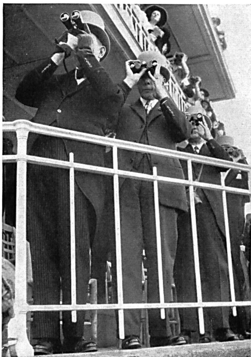
Chantilly : Prix du Jockey-Club, « Derby français ».