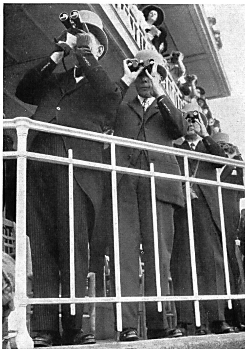
Chantilly : Prix du Jockey-Club, « Derby français ».